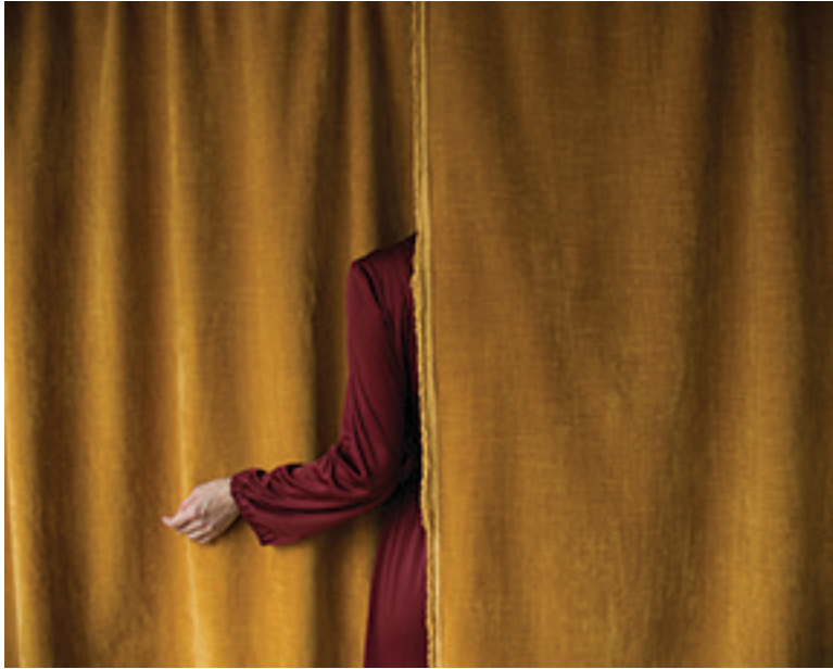
Dressing Room 1