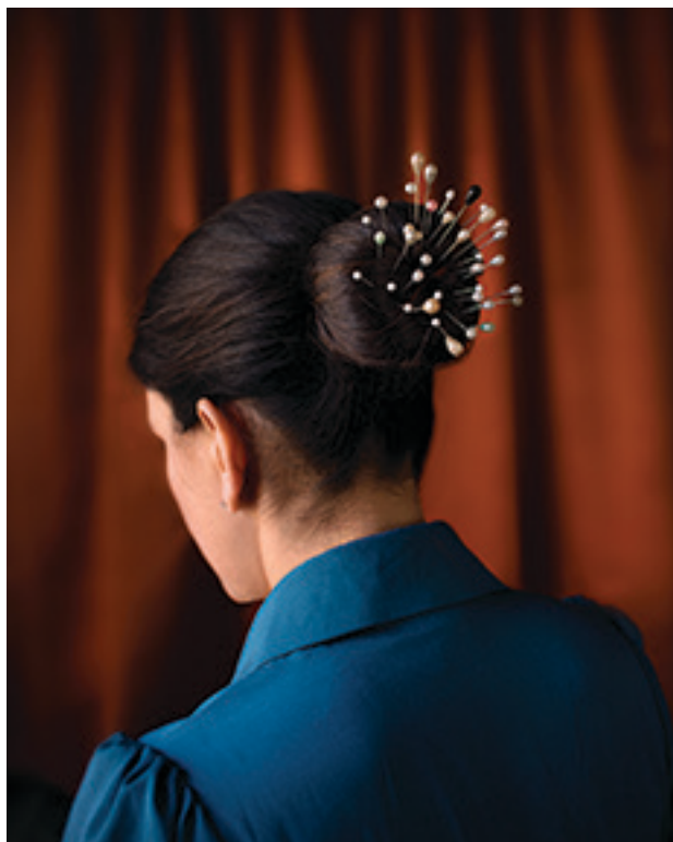
Bun 2020 16x20 - Edition of 10 $850 unframed, $1000 framed