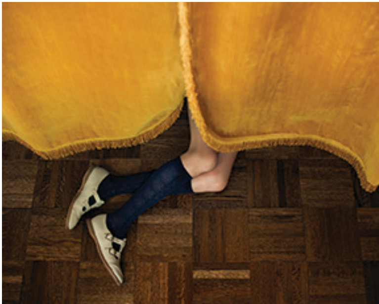
Dressing Room 2