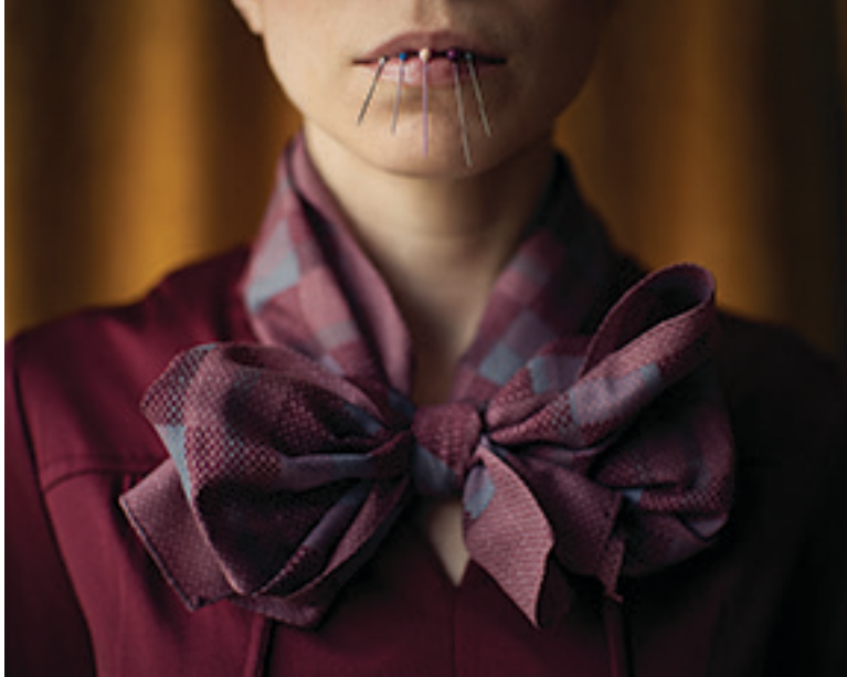
Pins and Needles 2017 16x20 - Edition of 10 $850 unframed, $1000 framed