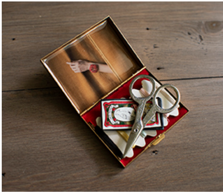
Gold Scissor Travel Kit - $150