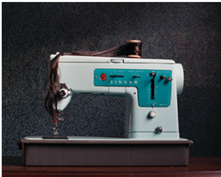
Lock 2015 16x20 - Edition of 10 $850 unframed, $1000 framed