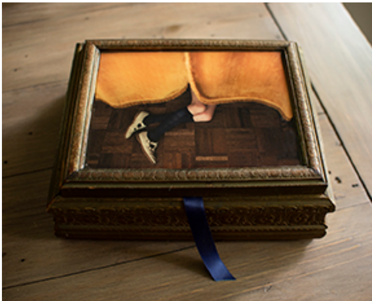
Dressing Room (buttons inside) - $450