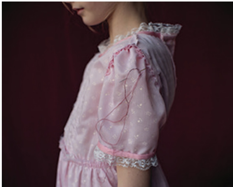
Deconstruction of a Memory