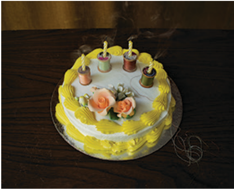
March 1 st 2017 16x20 - Edition of 10 $850 unframed, $1000 framed