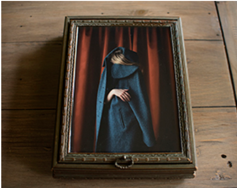
Coat (misc notions inside) - $400