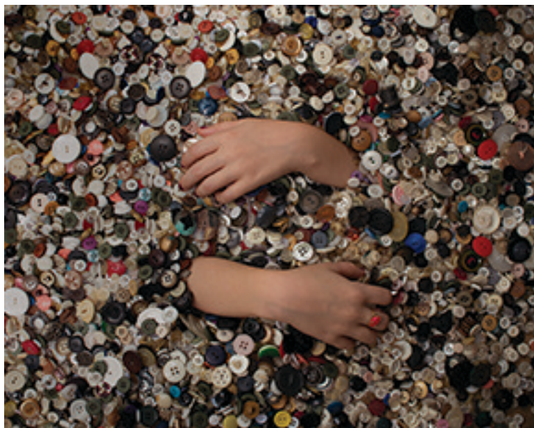
Buttons 2017 24x30 - Edition of 5 $1200 unframed, $1400 framed