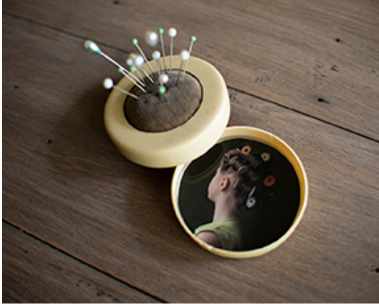
Celluloid Pin Cushion Box - $100