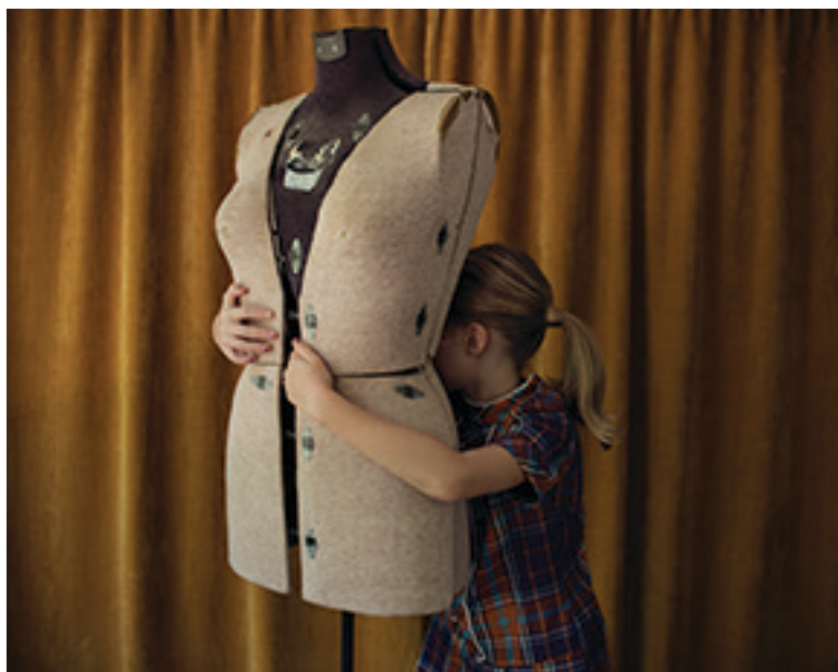
Never Let Me Go