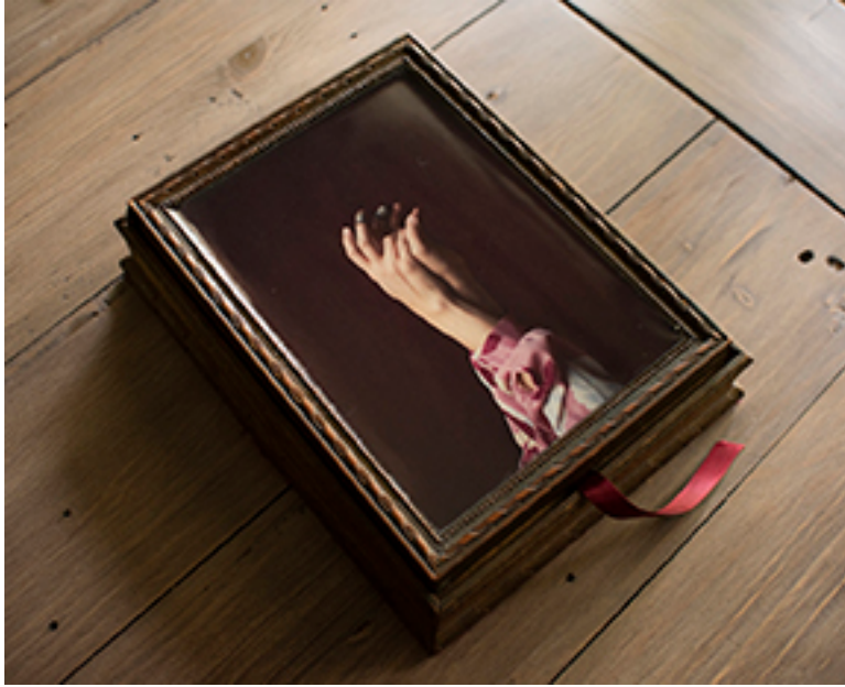
Thimble (thimbles inside) - $425