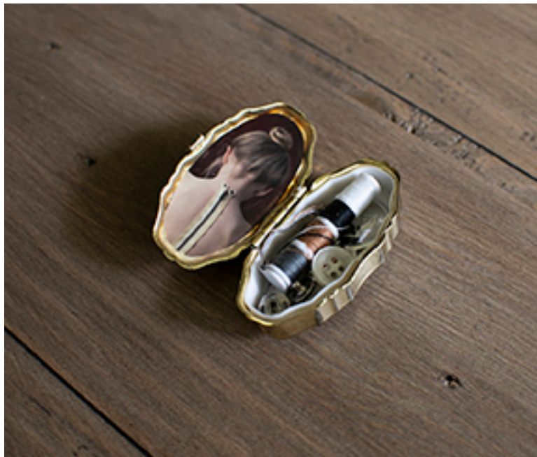
Floral Pill Box Kit - $100