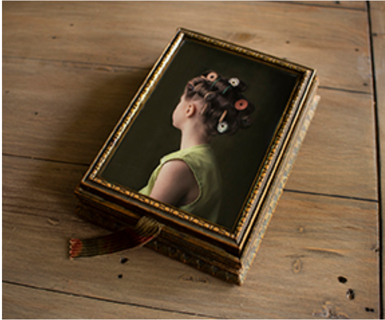
Curl (spools inside) - $375